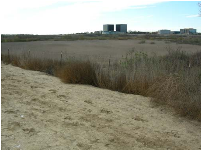
Photo 2. The San Joaquin Marsh Reserve, viewed from the access road along the San Diego Creek in southern part of IBC area, south of Campus Drive.