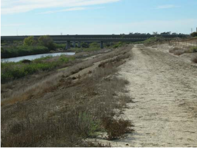
Photo 3. San Diego Creek in southern part of IBC area, north of MacArthur Boulevard, showing riparian vegetation along the channel. The area to the right of the access road is part of a proposed NCCP Reserve area (view looking south).