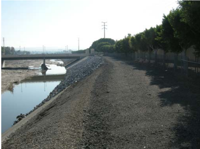
Photo 1. San Diego Creek in northern part of IBC area, south of Barranca Parkway, showing lack of vegetation along the channel and ornamental landscaping along the eastern edge of the access road (view looking south).